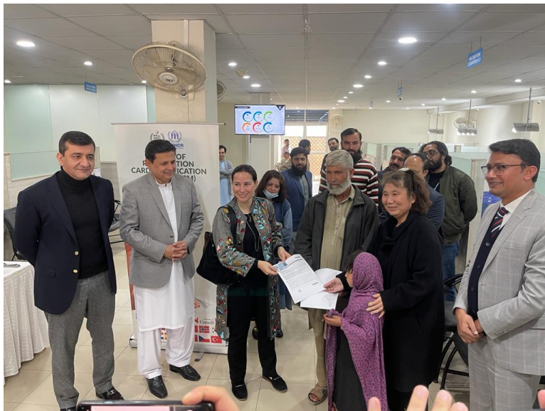
Islamabad, New verified smart PoR card is being delivered to the Afghan Refugee by the US Refugee Coordinator in DRIVE center. Commissioner – HQ, representatives of M/o Interior, NADRA and Country Representative UNHCR Pakistan also attended. Govt of Pakistan in collaboration with UNHCR renewed the PoR cards under DRIVE exercise.